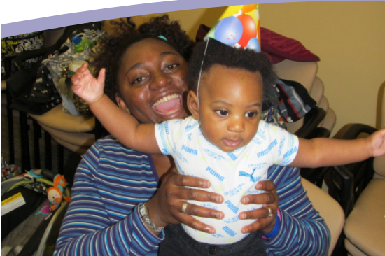
Mothers and babies stopped by the Piver Center to help celebrate the one year anniversary of the Baby Cafés.