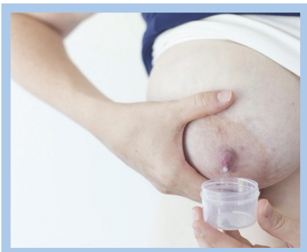
Mother hand expressing